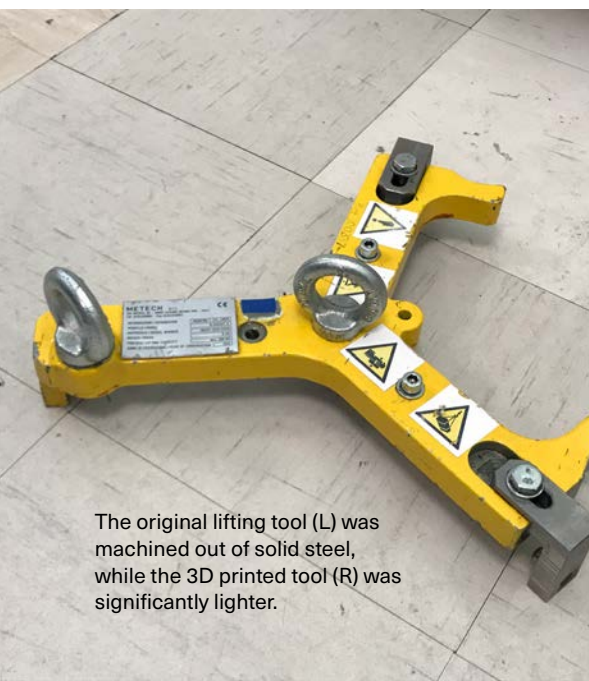
The original lifting tool (L) was machined out of solid steel, while the 3D printed tool (R) was significantly lighter.

JUHO RAUKOLA INNOVATION EXPERT (ADDITIVE MANUFACTURING), WÄRTSILÄ